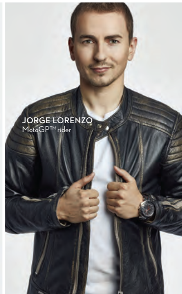
JORGE LORENZO MotoGP™ rider