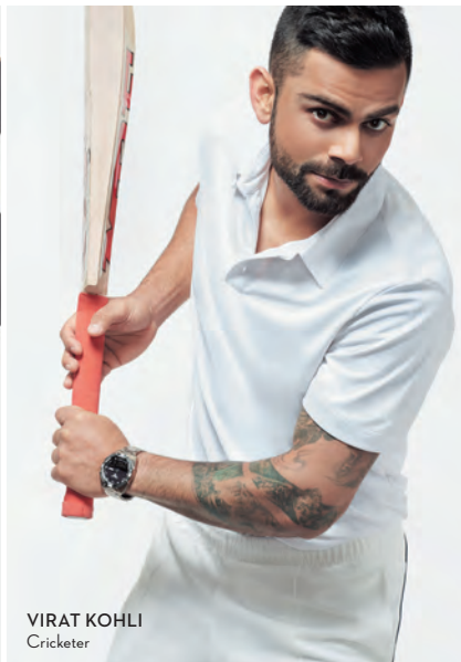
VIRAT KOHLI Cricketer