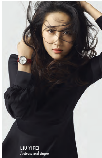
LIU YIFEI Actress and singer