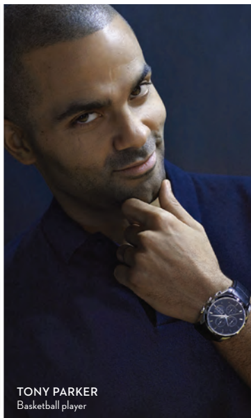
TONY PARKER Basketball player